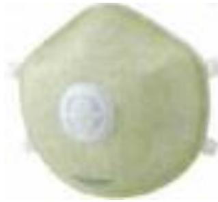
Hi-Luck “Utsusanzo” respirator for patient use only

Especially in the long-term care facilities where elderly people live in a group, once a member of them becomes sick, it is important to immediately take a step to prevent the further spread of infection. In preparation for such situation, Hi-Luck “Utsusanzo” respirator should be used to prevent the spread of influenza.